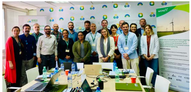
Figure 3. Physical meeting in WENDY

The preliminary agenda of these events includes, besides the technical and administrative related topics, other side activities based on dissemination and exploitation, aiming to not only spread the awareness of the project but allow networking activity among the project partners and the industries themselves. In this sense, the coordinator, CIRCE, has already a wide experience organizing meetings side events to promote projects activities.